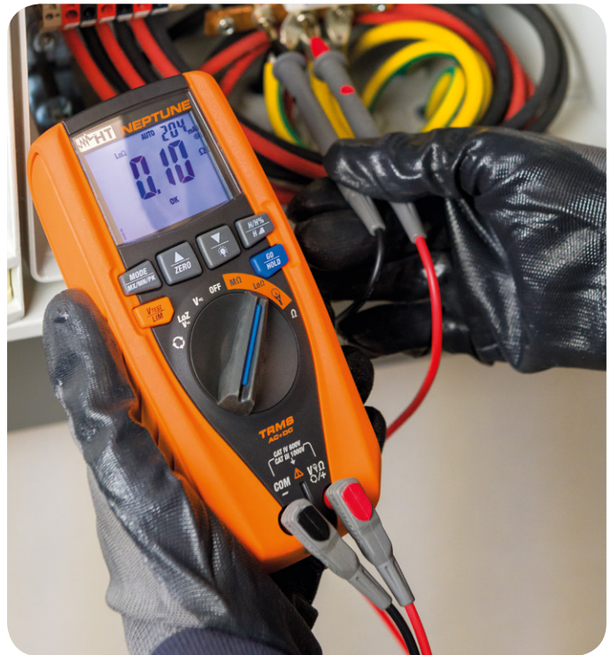
Continuity of protective conductors with 200mA.