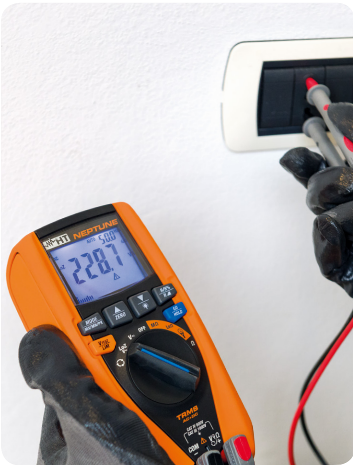
Zeroing of stray voltage .