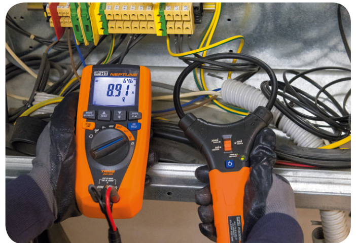
Measurement of current through flexible transducer F3000U .