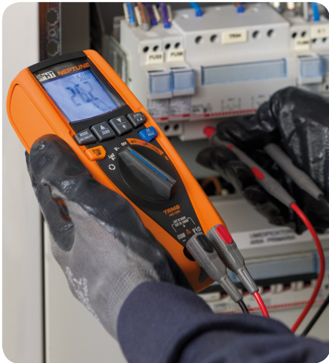
Voltage measurement with test leads.