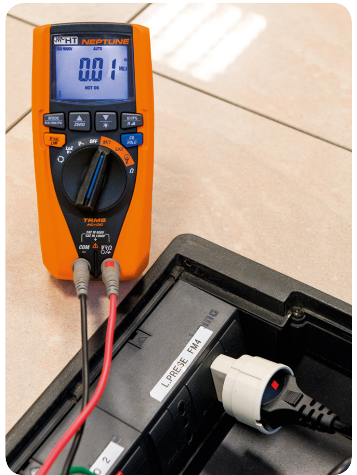
Measurement of Insulation Resistance (optional Schuko C2065 adapter).