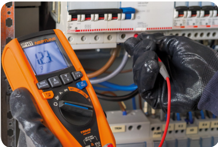
Measurement of phase sequence with one lead .