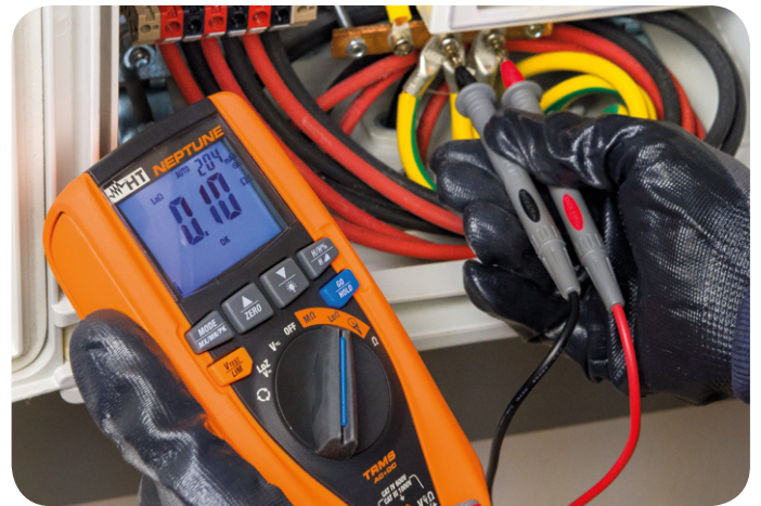
Continuity of protective conductors .